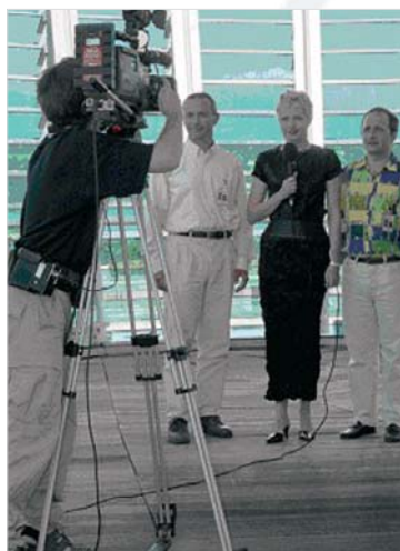
▶ Live broadcast of the Télévision Suisse Romande's weather programme «Tout en région» on the occasion of the inauguration of the new Météo Genève offices in the WMO building.

population and the cantonal emergency services in the case of impending storms. This involves developing new products that will help us warn our customers of the consequences of dangerous weather situations. One of these products is the so-called flash-orage, which informs our customers of impending thunderstorms by mobile phone. We have been offering flash-orage, to whose development Météo Genève made a significant contribu-